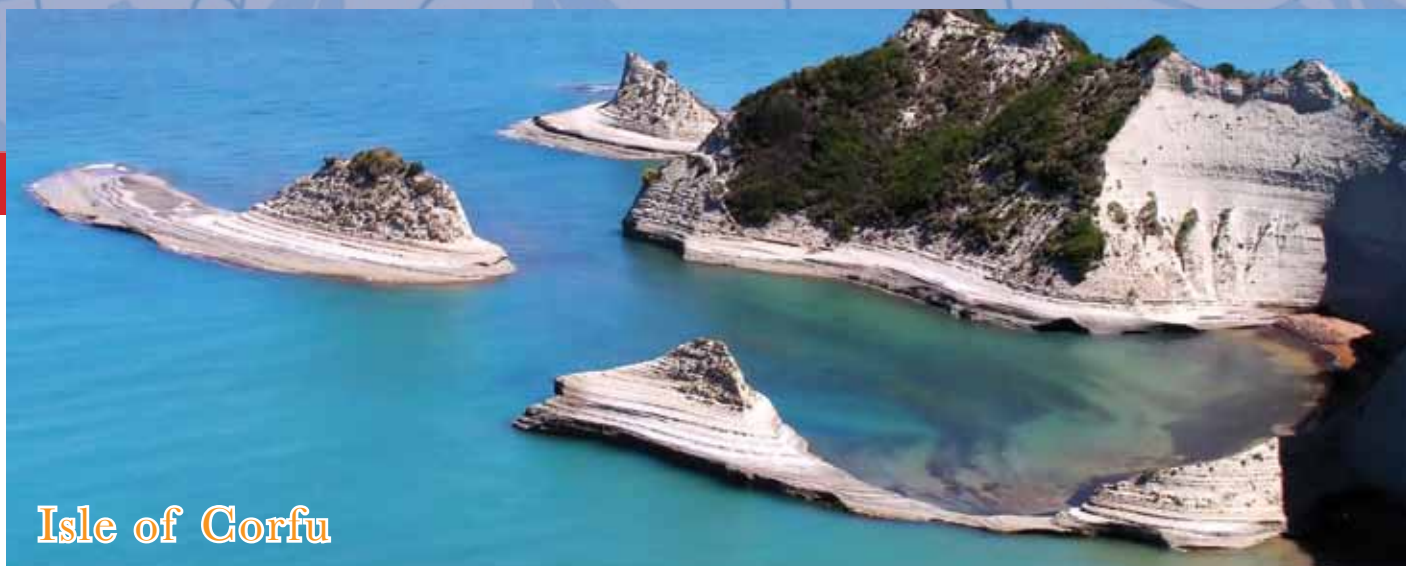
Isle of Corfu